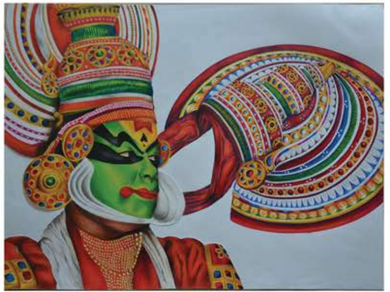
Malavika Ramesh, 10 IGCSE B